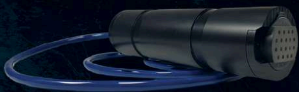
AQ5 5m rated

Profilers, Buoys, Vehicles, Moorings, River Stations, Sondes, Ferry boxes, Flow-through Systems & Flow Lines.